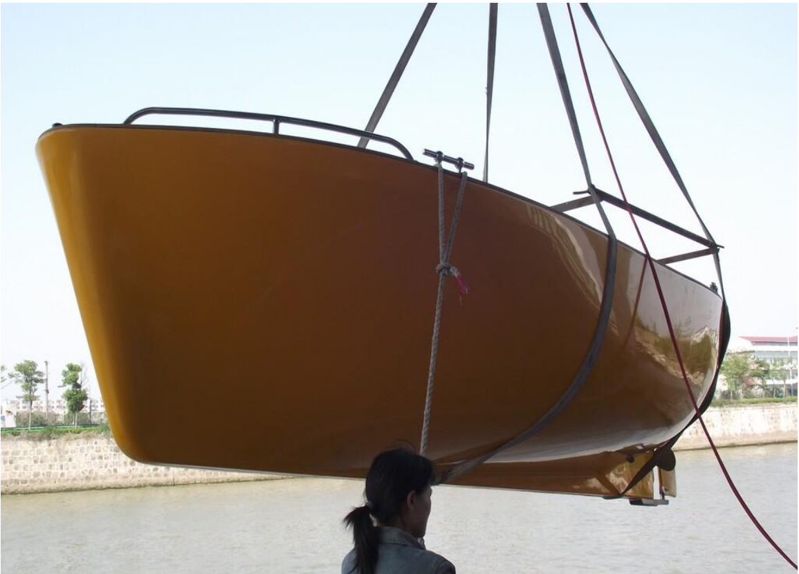
one boat in a 20'container 4 boats fit in a 40h container